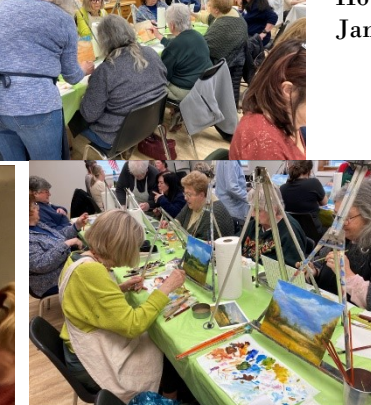
We had a FULL House for the January program!