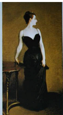
John Singer Sargent, Madame X (Madame Pierre Gautreau), 1883-1884 THE METROPOLITAN MUSEUM OF ART, NEW YORK