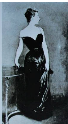
Photograph of Madame Gautreau, 1884