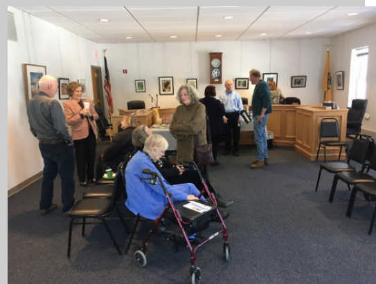
We had a good turn out with several visitors and some sales!

Warren County ARTS (501c (3) organization)