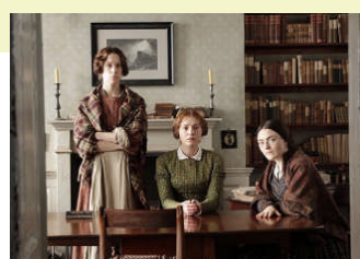
Emily, Ann, and Charlotte Brontë

My fellow Artists, I have long been a fan of PBS, but I'm going to put the 's' in WCART(s), when I tell you about an Extraordinary production of theirs charting the struggles and