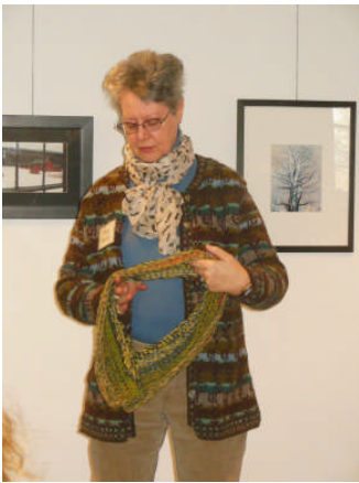
Pam Dulaff - Crocheted cow made last month after taking classes this past summer.